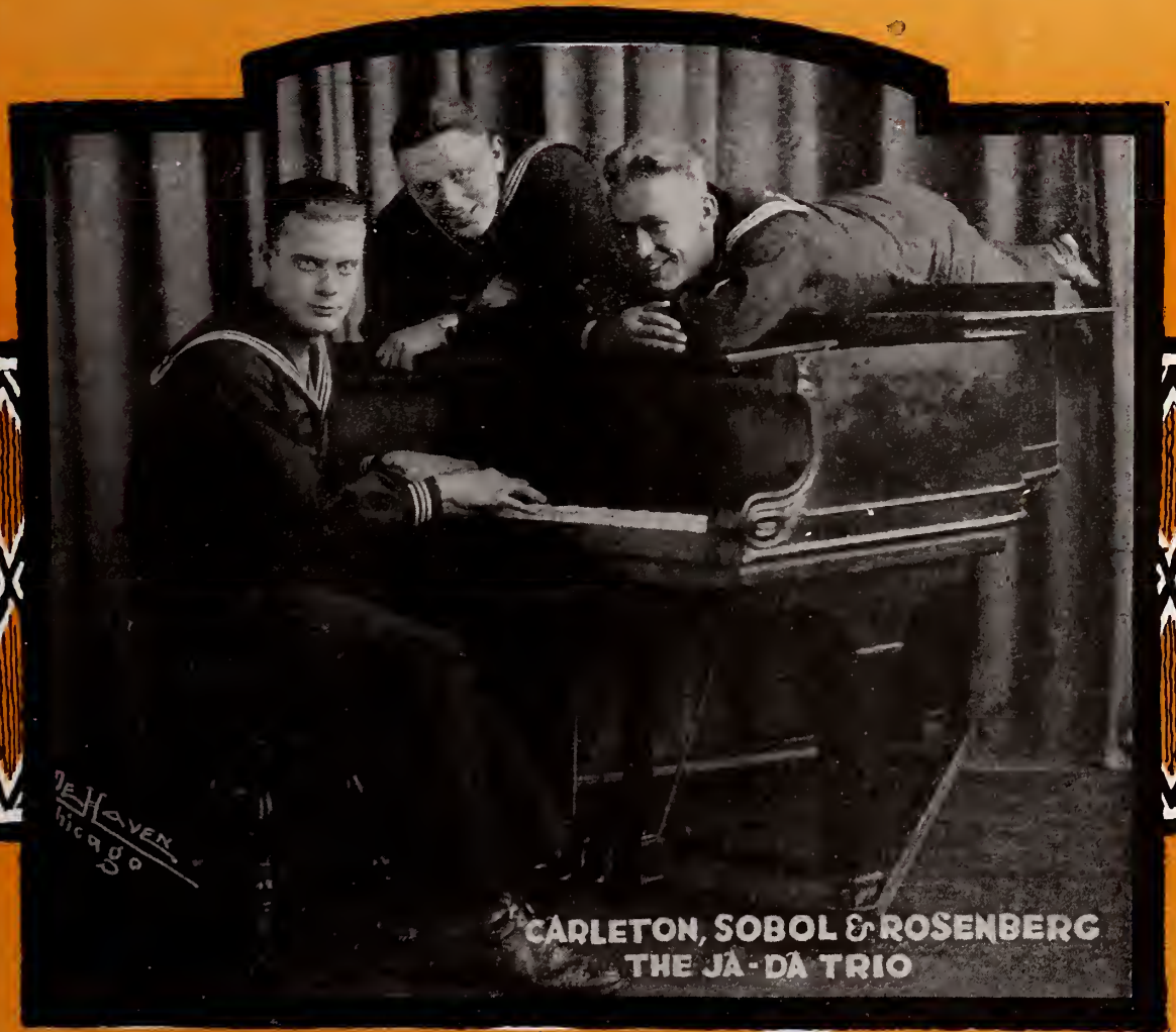
CARLETON, SOBOL & ROSENBERG THE JÄ-DÄ TRIO

THE SALE OF THIS SONG WILL BE FOR THE BENEFIT OF THE NAVY RELIEF SOCIETY.